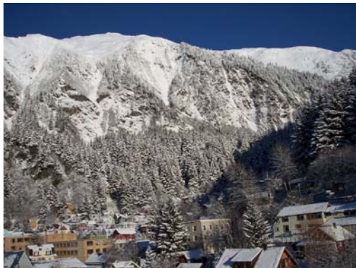
Picturesque scene from Juneau, Alaska

The IIMC Distance Education Program is up and running. Check out the available courses on the IIMC website. Courses include: Introduction to Law, Managing change and conflict; Communication Part I - Interpersonal; Communication Part II - Organizational. Continuing education points are 4 - CMC, 4 MMCA and 24 Recertification hours. Cost $165.00 for members.